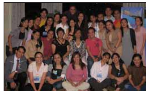
Newly hired Tacoma RNs

The week ended with a celebratory dinner that included hospital representatives, HCCA staff, and the newly hired nurses. It was a night of good food, excellent company, and great music with an exceptional band. Not only are the nurses skilled in their profession, but many are born to sing as well!