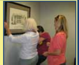
Stage 5: Finishing touches!