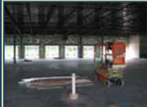
Stage 1: Where are the walls?

Three weeks later we are still settling in, hanging pictures and working out the kinks, but we love it! If you are ever in the area, please drop in and say hello! We would love to meet you and give you the grand tour!