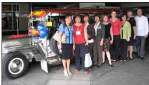
Getting a ride to work in a Jeepney!

hospitals. Tacoma, Washington hired 41 nurses and Houston, Texas hired 47.