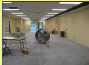
Stage 3: Ceiling and Paint!