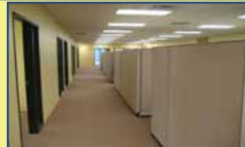
Stage 4: Almost done!