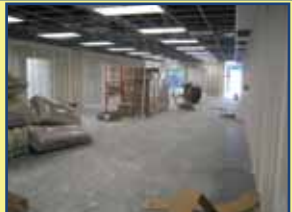
Stage 2: There they are!