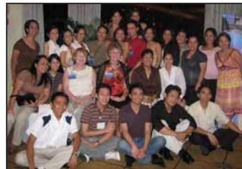
Newly hired Houston RNs

She also conducted public seminars on the latest pediatric nursing trends in the U.S. and Dallas culture.